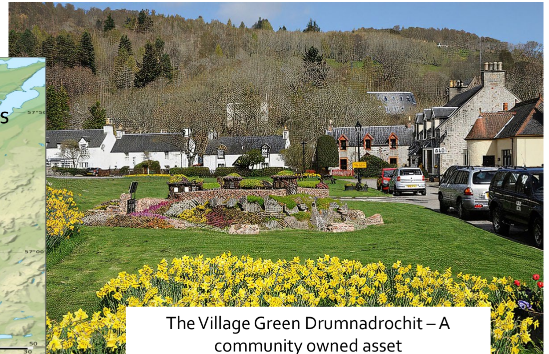
The Village Green Drumnadrochit – A community owned asset